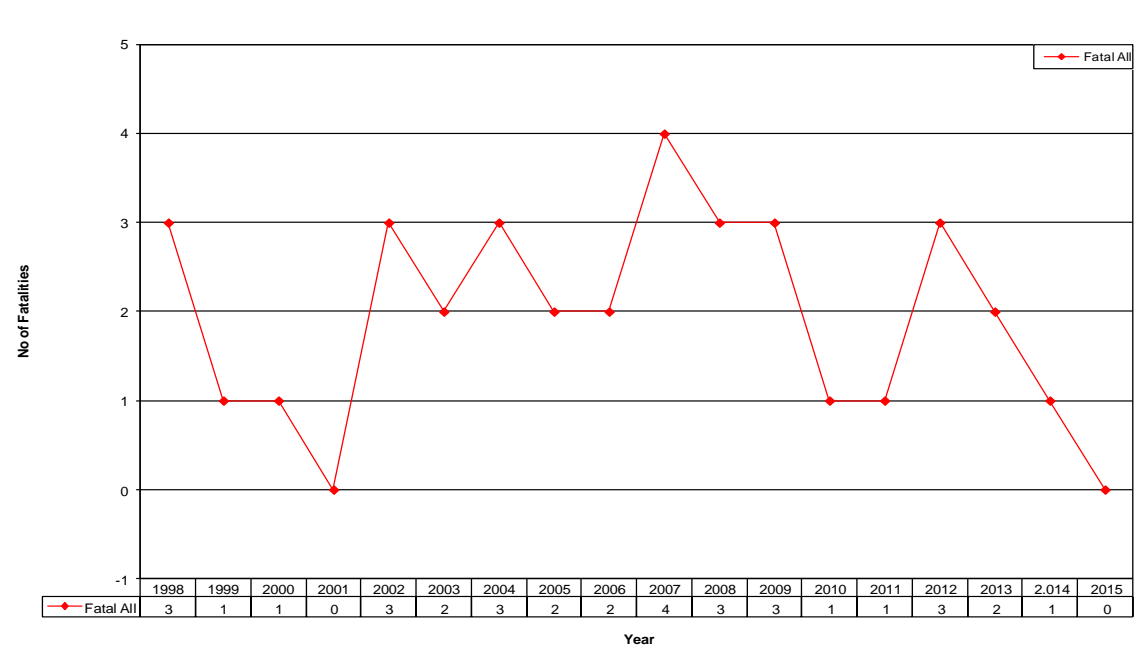
Figure 1 - Fatalities (all ages)

Fig 1 shows the number of fatalities that have occurred within Torbay