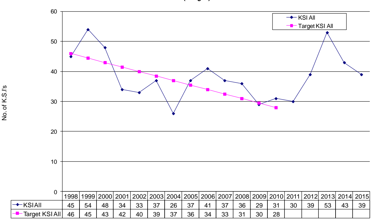
Figure 2 - Killed and seriously injured (K.S.I.) (all ages)

Fig 2 shows the number of people killed or seriously injured within Torbay.